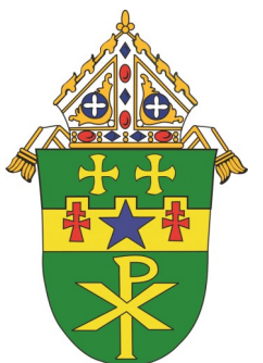
Diocesan Coat of Arms

Confessions: First Saturday of the month, 11:00-11:30 AM at St. Ambrose or by appointment with the Pastor.