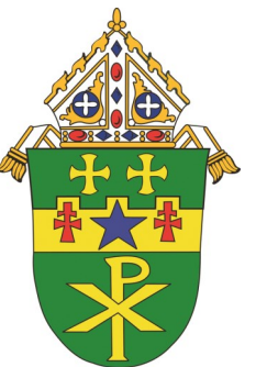
Diocesan Coat of Arms

Confessions: First Saturday of the month, 11:00-11:30 AM at St. Ambrose or by appointment with the Pastor.