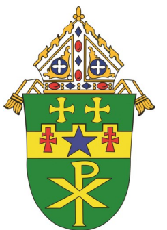
Diocesan Coat of Arms

Confessions: First Saturday of the month, 11:00-11:30 AM at St. Ambrose or by appointment with the Pastor.