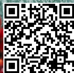
GIVING QR Code