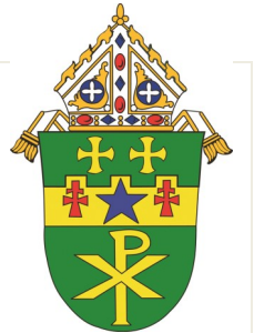
Diocesan Coat of Arms

Confessions: 45 minutes prior to the weekend Mass start times or by appointment with the priest.